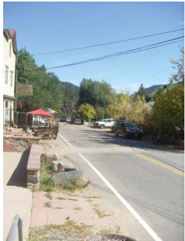
Figure 5-4: Boulder County and Jamestown share responsibility for County Road 94 through town

4. Parking in Jamestown should maintain a natural, unpaved, mountain town characteristic to allow access to businesses; large paved parking areas should be avoided.