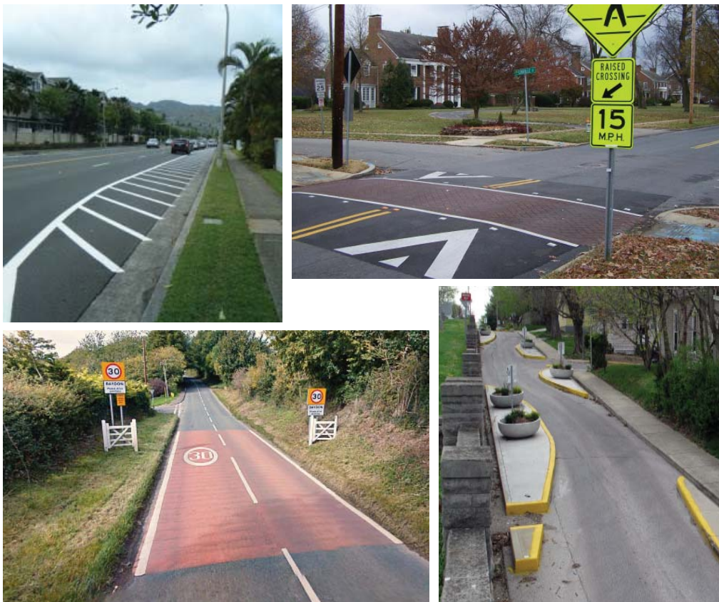
Figure 5-5: Example approaches to traffic calming that may be considered along Main Street / County Road 94 - striping (upper left), raised crosswalks (upper right), signage and paint / pavers (lower left), bump-outs (lower right)