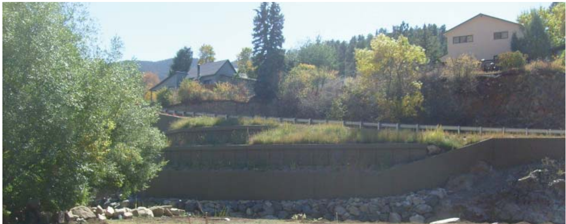
Figure 5-1: Andersen Hill Street

Jamestown is small, walkable, and rural in character. Jamestown's streets are unpaved dirt surfaces except for County Road 94 (Main Street / Mill Street) which is paved through town. Town roads are generally narrow and sometimes allow only one direction of traffic. Erosion from improper drainage can cause damage. These aspects and the steep grades of Mesa, Spruce, 12th, and Andersen Hill Streets can make access to the higher plateau particularly difficult.