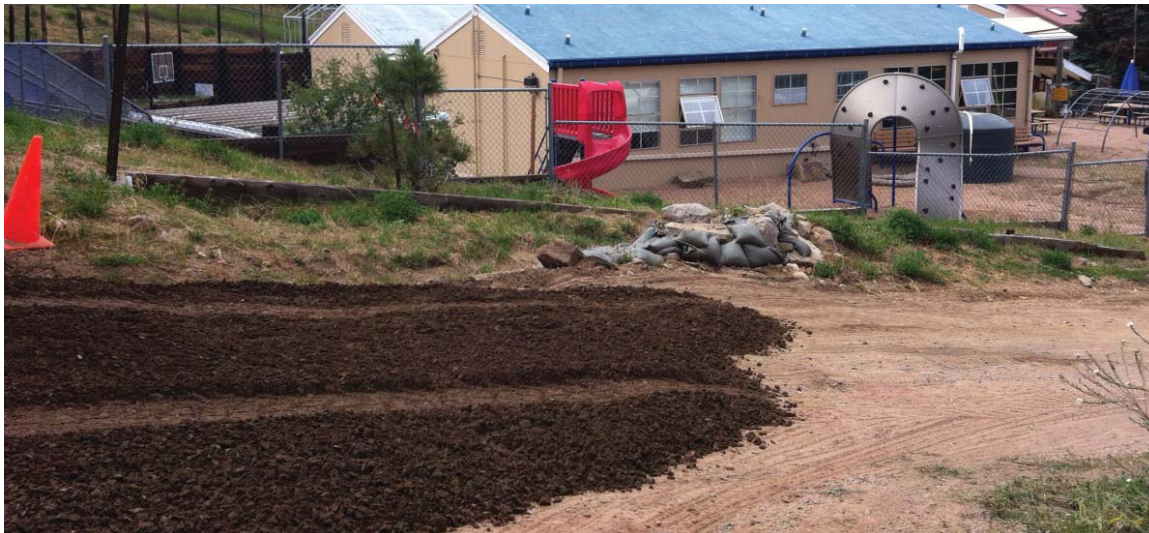
Figure 5-3: The majority of roads in town have dirt surfaces; above: 16th Street overlay project

Roads and Bridges Committee - The Roads and Bridges Committee includes a representative from the Board of Trustees and other volunteers from the community. The committee addresses issues and maintenance associated with roads, bridges, culverts, and drainage along the roadways.