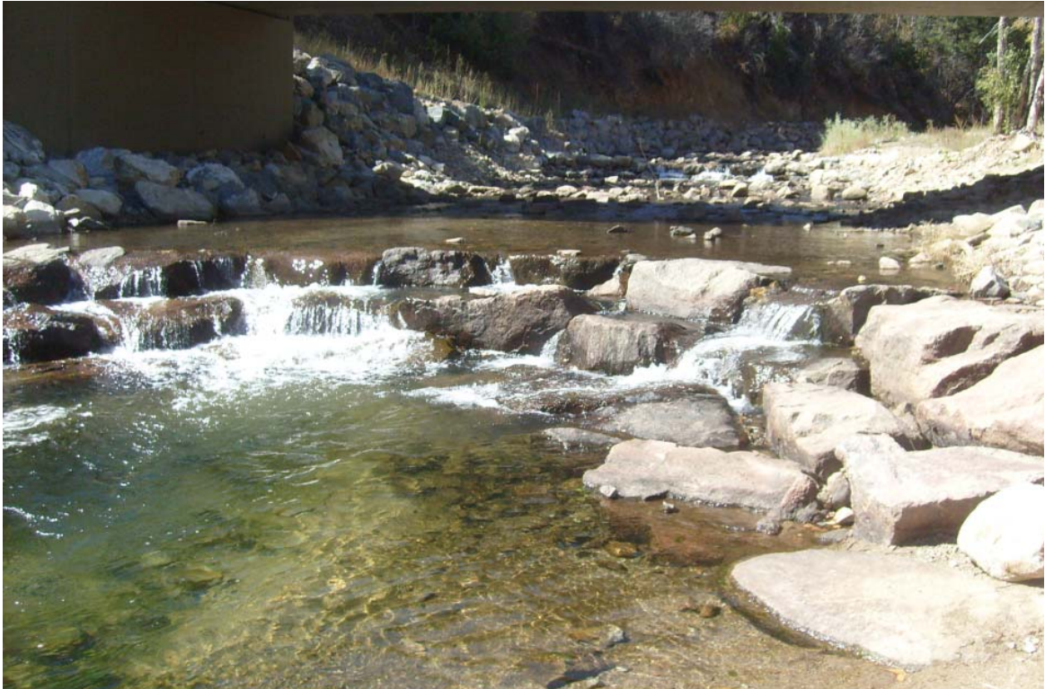
Figure 3-1: Drop structures along James Creek

The vision and values of Jamestown for this comprehensive plan update is derived from the community values and vision presented in the nine Guiding Principles, Jamestown Area Long Term Recovery Plan (LTRP) and the Land Use and Housing Study . The Jamestown community spent many months on the development of the LTRP and, although the process was not for the preparation of a comprehensive plan, community values were identified and a vision established that remain valid and should be respected.