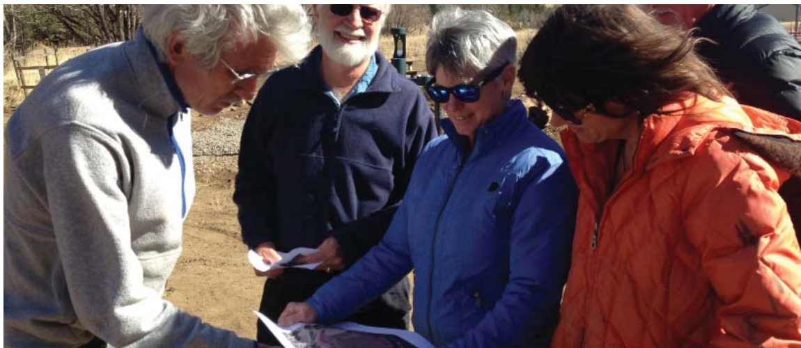
Figure 6-4: Water Committee in the field

Water quality is very important for the community. Being located near the top of the watershed, as Jamestown is, can be a benefit to the community because there are fewer land uses between the water source and the water treatment system that might compromise the water quality. However, due to the presence of local individual on-site wastewater treatment systems, contaminated soils due to past mining operations, and by the threat of regional hazards such as