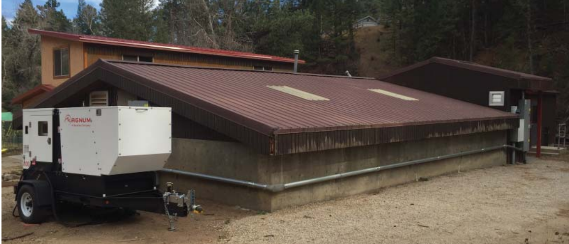
Figure 6-2: Jamestown Water Treatment Plant

The Jamestown water supply for the water treatment plant is obtained from the James Creek via two distinct sources: an infiltration well and surface water off of the creek. One of the sources is located on Main Street and the other is located on Mesa Street. Both sources have very good infrastructure after improvements made in 2014 and 2015 as a result of rebuilding the system after the 2013 flood event.