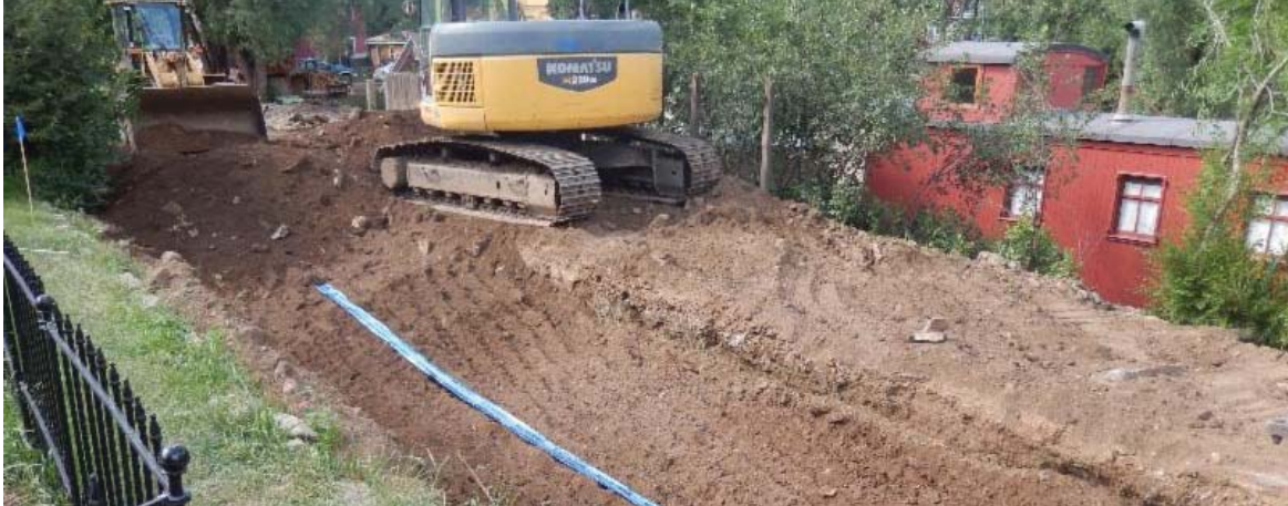
Figure 6-1: Installing water lines in the Lower Main Street right-of-way in 2014

While the Town of Jamestown provides water service to most residences within the community, some properties are served by individual wells. Wastewater treatment is provided by individual on-site wastewater systems that are regulated and permitted by Boulder County. Other common utilities, such as internet and electricity, are made available by private (non-Town of Jamestown) providers.