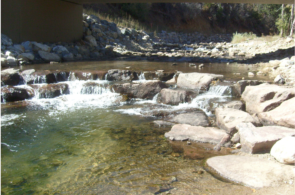
Figure 3-1: Drop structures along James Creek

The vision and values of Jamestown for this Comprehensive Plan update is derived from the community values and vision presented in the Nine Guiding Principles, Jamestown Area Long Term Recovery Plan (LTRP) and the Land Use and Housing Study. The Jamestown community spent many months on the development of the LTRP and, although the process was not for the preparation of a comprehensive plan, community values were identified and a vision established that remain valid and should be respected.