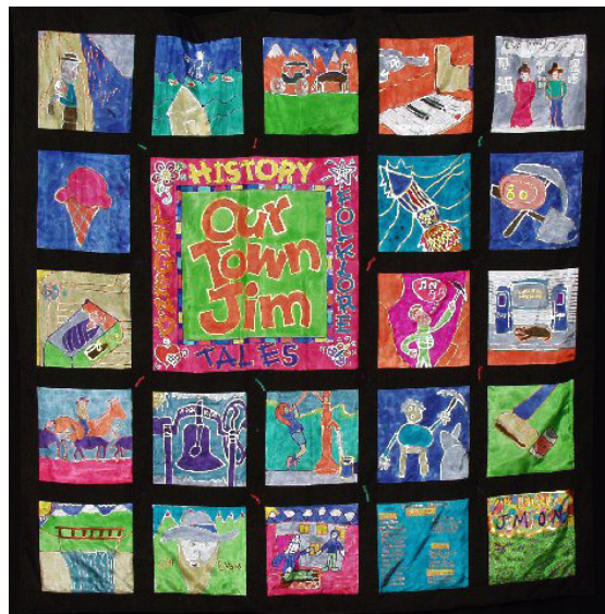
Figure 3-2: Jamestown community quilt

A vibrant community through arts, culture, recreation and history is the Jamestown tradition and identity. The community has a rich music and arts community and values the town facilities - such as Elysian Park and the Town Square - that provide a presentation ground where the entire community can participate. Ensuring community assets remain robust and engaging is vital for the community as it evolves over time.